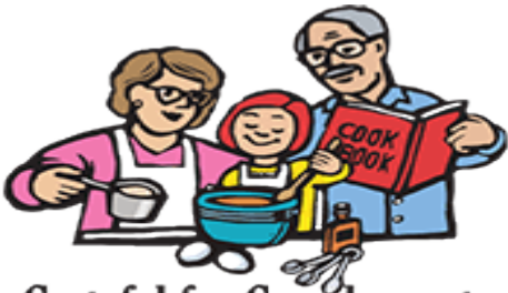
Grateful for Grandparents